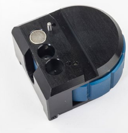
Fig 4: New Self-Indexing Magazine (introduced 2020). Pin/magnet are factory-set for right-side insertion/removal

Back-compatibility with the older rifle models will vary. It is really a case of seeing if a magazine works or not because rifles made pre-2013 will have been subject to evolving manufacturing updates within the same model lines. Notably, there are three distinct designs of the magazine indexing mechanism incorporated in the breech blocks across various models, identifiable as: pawl (slider), indexing pin or self-indexing (nothing) Fig.5 not shooter-swappable).