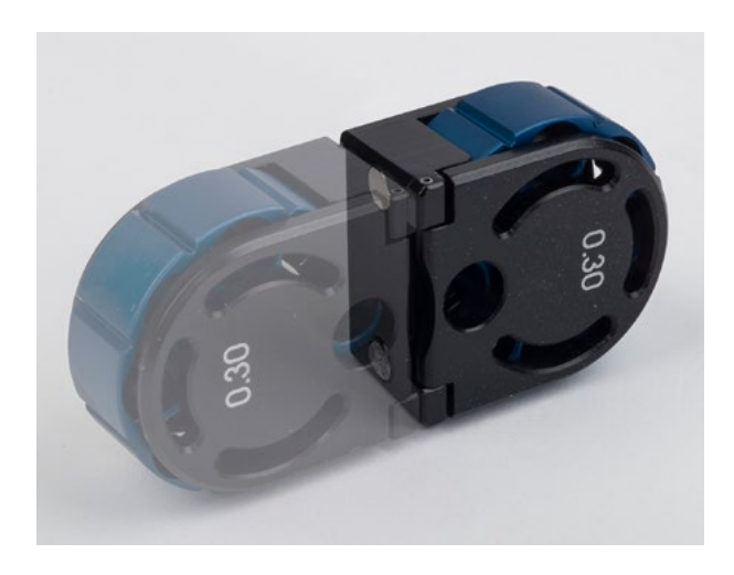
Fig 6: New Delta Wolf Self-Indexing Magazine (not compatible with other rifle models at 2020)

* UPDATE: Late 2020 sees the arrival of Daystate's flagship new Delta Wolf. It is equipped with a Self-Indexing Magazine that is exclusive to this model of rifle [fig 6]. Its magazine therefore will not operate in the Wolverine, Pulsar, Renegade or RedWolf models – and their magazines (whether Multi-Shot or Self-Indexing) will not work in the Delta Wolf.