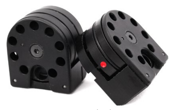
Fig 1: Late-version Daystate Multi-Shot Magazines

Since 2002, Daystate has manufactured many rifle models that feature a Multi-Shot Magazine [fig 1] to auto-load the pellet during the cocking process. Apart from the PH6 rifle (production 1997-2002), which used a fixed magazine design, Daystate's adopted Multi-Shot Magazine platform was standardised across all multi-shot rifle models and mainly offered a 10-shot capacity.