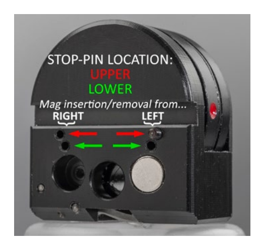
Fig 3: Additional upper and lower stop-pin positions for specific rifle models. Huntsman-style breeches require the lower position; breeches on the Pulsar, Renegade, Wolverine and RedWolf require the pin in the upper position

From 2010, Daystate's portfolio of rifle models began expanding rapidly and to suit the growing range, the Multi-Shot Magazine's stop-pin position had to change to accommodate newly designed breeches. Multi-Shot Magazines manufactured after October 2013 have upper and lower stop-pin positions on the rear of the magazine [fig 3].