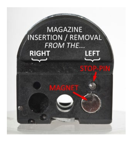
Fig 2: Double stop-pins (with magnet) to allow magazine to be inserted/extracted from right or left of breech

Around 2008, the Multi-Shot Magazine was improved to allow insertion/removal from either the left or the right of the breech block. These magazines incorporated a small stop-pin (and, later, a magnet to ensure accurate chamber/bore alignment) on the back of the magazine which could be swapped from one side to the other to suit the loading side preference [fig 2]. Up to c.2017, this could be altered by the shooter; after that, it became a factory-request option (and not shooter-swappable).